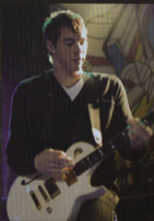
TIM LOPEZ PLAIN WHITE T'S