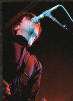
JT WOODRUFF HAWTHORNE HEIGHTS