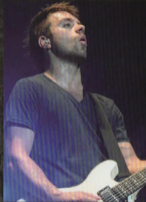
SEBASTIEN LEFEBVRE SIMPLE PLAN