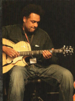
JEAN-PAUL BOURELLY THREE KINGS