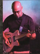
BON LOZAGA GONGZILLA