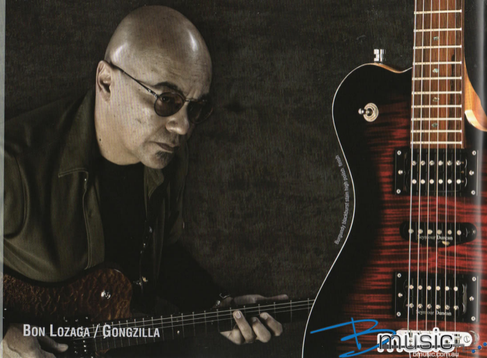
BON LOZAGA / GONGZILLA

Burgundy blackburst stain high gloss finish