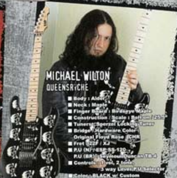
MICHAEL WILTON QUEENSRYCHE