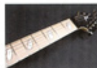
Maple Fingerboard with Clock Inlay