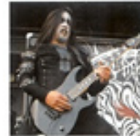
JESSE "THE INFERNAL" (CHTHONIC / INFERNAL CHAD)