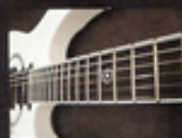
12 Fret "Arch Enemy" Symbol