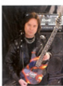
ANDY LA ROCQUE (KING DIAMOND)

NECK JOINT: Bolt-on Neck NECK SCALE: 648mm (25 1/2inch), 24Frets HEAD STOCK: Devil's Tail with "Dellinger" Logo Inlay/White Binding MACHINE HEADS: Gotoh SG381-07H.A.P NUT: Schaller Locking Nut R2, Nut Width 42mm NECK MATERIAL: Hard Maple/Oil Finish FINGERBOARD MATERIAL: Ebony with Clock Inlay/White Binding FRETWIRE: Jumbo Frets BODY MATERIAL: Mahogany BRIDGE: Schaller S-FRT II NECK PICKUP: Caparison PH-nc BRIDGE PICKUP: Caparison PH-bc CONTROLS: Master Volume(CTS), 3 Way Toggle Switch(Mini), Master Tone(CTS) BODY FINISH: Titanium, Aluminium HARDWARE: Schaller-Black, Gotoh-Cosmo Black STRINGS: Dean Markley Nickel/Steel Light (.009 - .042) TUNING: Regular