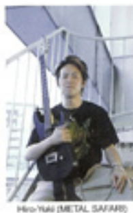
Hiro Yuki (METAL SAFARI)

NECK JOINT: Bolt-on Neck NECK SCALE: 635mm (25 1/8") 24 frets HEAD STOCK: Devil's Tail Bass with "Dellinger" Logo Inlay MACHINE HEADS: Gotoh GR707 NUT: Gotoh Tech, Nut Width 38mm NECK MATERIAL: 5 Ply Maple/Walnut Oil Finish FINGERBOARD MATERIAL: Rosewood (240R) with Clock Inlay FRETWIRE: Jumbo Frets BODY MATERIAL: Ash BRIDGE: Gotoh Wilkinson W580-4 NECK PICKUP: EMG P BRIDGE PICKUP: EMG J CONTROLS: Neck Pickup Volume, Bridge Pickup Volume, Master Tone BODY FINISH: Pro.Black HARDWARE: Cosmo Black STRINGS: Dean Marliny Medium G10 (.045 - .105) TUNING: Regular