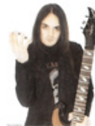
NILS NORBERG

NECK JOINT: Bolt-on Neck NECK SCALE: 648mm (25 1/2inch), 24Frets HEAD STOCK: Devil's Tail 7 with "Dellinger" Logo Inlay MACHINE HEADS: Gotoh SG381-07H.A.P NUT: Graph Tech Black TUSQ, Nut Width 49mm NECK MATERIAL: 5Pos. Maple-Walnut/Oil Finish FINGERBOARD MATERIAL: Rosewood with Clock Inlay FRETWIRE: Jumbo Frets BODY MATERIAL: Mahogany BRIDGE: Caparison Fixed Bridge7 NECK PICKUP: Caparison PH-F BRIDGE PICKUP: Caparison PH-F CONTROLS: Master Volume(CTS), 3 Way Toggle Switch BODY FINISH: Oiled Mahogany, Pro.Black HARDWARE: Cosmo Black STRINGS: Dean Markley NickelSteel 2502C Light (.009 - .042 - .054) TUNING: Regular + Dropped B