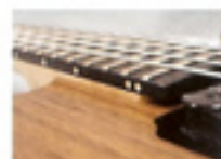
Luminous Side Dots