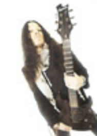
FREDRIK MANNBERG (NOCTURNAL RITES)