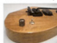
Pickup Selector Switch