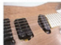
PH-R & SH-27F Pickup