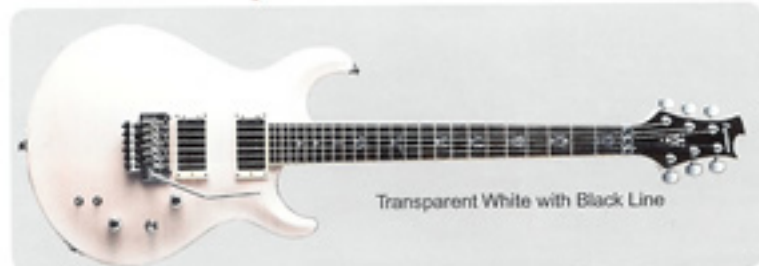
Transparent White with Black Line