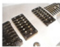
Caparison New Pickup PH-bc / PH-nc

MC stands for Metal Color, and the body finish gives the metallic looks. Contrary to the concept, Caparison has had the special finishing technique with hard coating. Mid control range is enhanced and low range sounds are well-balanced by shifting to low sound with Pro Color. PH-R / PH-F pickup is refined to take advantage of the finishing character. Therefore makes new sound model even more unique. (New Pickup: PH-bc / PH-nc)