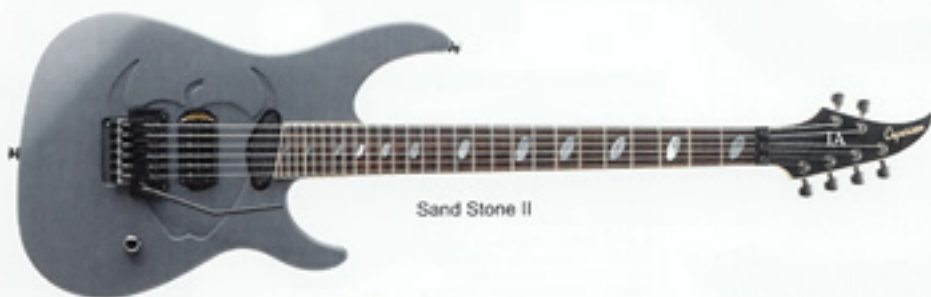
Sand Stone II

It has a simple control the Push-Push switch control allows quick changeover to select the pickup as well as adjustment of the master volume.