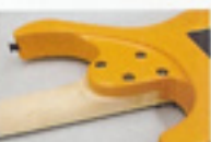
Neck Joint and Heel Cut

"SH-27F" is mounted which was developed for 27-fret guitar neck position. (Push-Push switch control does NOT have mixed position with Bridge Pickup and Neck Pickup)