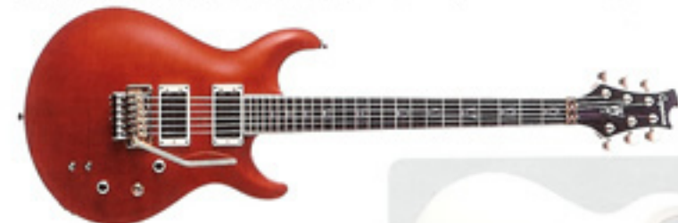
Transparent Red with Black Line

Split coil switches are utilized for each pickup to help make a wide range of sounds, and the two volume controls allow for subtle adjustments.