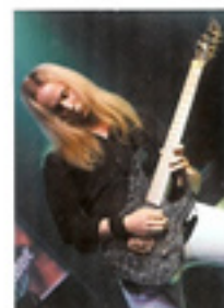
OLOF MORCK (DRAGONLAND / NIGHTRAGE)