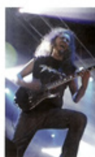
JOEL STROETZELL (KILLSWITCH ENGAGE)

NECK JOINT: Bolt-on Neck NECK SCALE: 648mm (25 1/2inch), 24Frets HEAD STOCK: Devil's Tail with Dellinger Logo Inlay MACHINE HEADS: Gotoh SG381-07H.A.P NUT: Graph Tech Black TUSQ, Nut Width 42mm NECK MATERIAL: Hard Maple/Oil Finish FINGERBOARD MATERIAL: Ebony with Luminous Side Dots FRETWIRE: Jumbo Frets BODY MATERIAL: Walnut BRIDGE: Caparison Fixed Bridge6 NECK PICKUP: Caparison PH-F BRIDGE PICKUP: Caparison PH-R CONTROLS: Master Volume(CTS), 3 Way Toggle Switch BODY FINISH: Oiled Walnut, Pro.Black HARDWARE: Cosmo Black STRINGS: Dean Markley NickelSteel (.012 - .054) TUNING: B tuning = B, F#, D, A, E, B