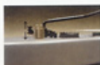
Master Volume with 2 Way Pickup Selector Switch