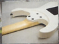
Neck Joint and Heel Cut