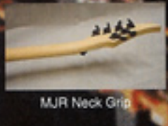
MJR Neck Grip