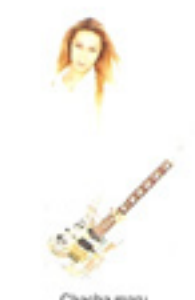
Chacha maru (GACKT JOB/RENA)