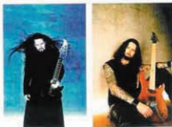
TOM S. ENGLUND (EVANGELIST)